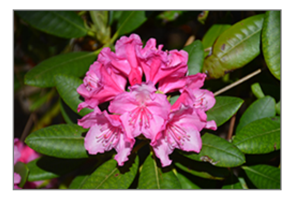
Haaga Rhododendron flowers

A relatively new broadleaf evergreen shrub with rich deep pink flowers in spring, coarse dark foliage and an upright mounded habit, quite hardy; absolutely must have well-drained, highly acidic and organic soil, use plenty of peat moss when planting