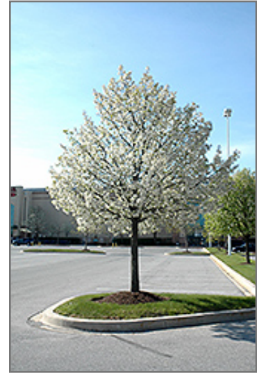
Jack Ornamental Pear in bloom