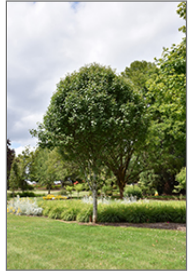
Jack Ornamental Pear

This tree should only be grown in full sunlight. It prefers to grow in average to moist conditions, and shouldn't be allowed to dry out. It is not particular as to soil type or pH. It is highly tolerant of urban pollution and will even thrive in inner city environments. This is a selected variety of a species not originally from North America.