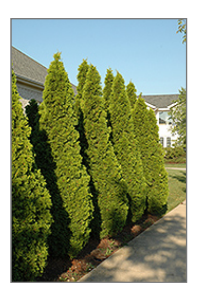
Emerald Green Arborvitae