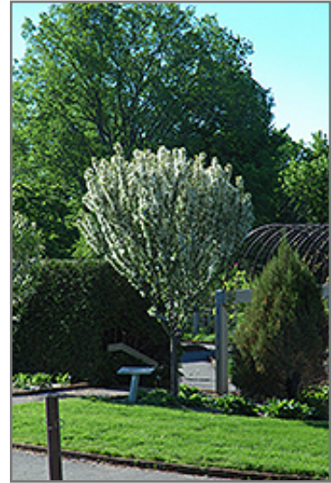
Adirondack Flowering Crab in bloom