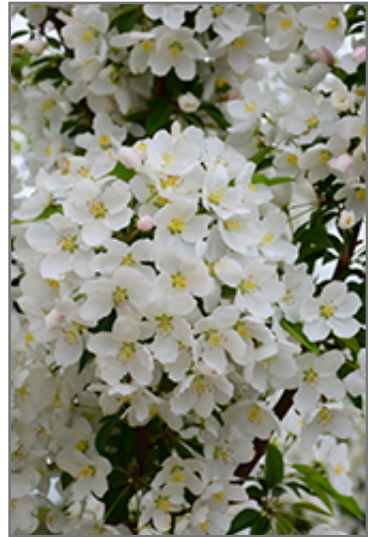
Adirondack Flowering Crab flowers