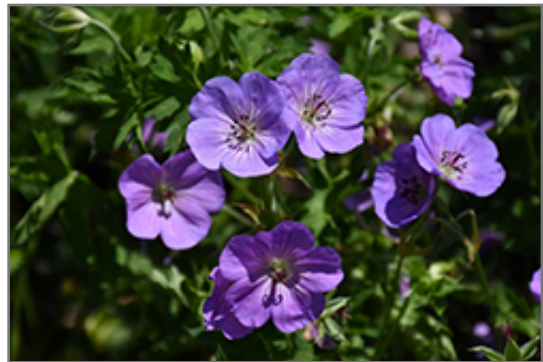
Azure Rush Cranesbill flowers