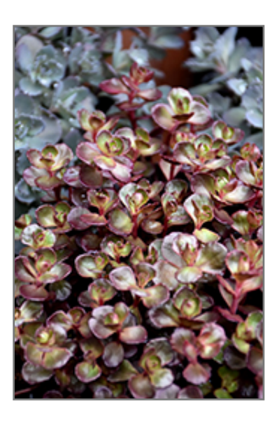
Voodoo Stonecrop foliage

Voodoo Stonecrop is recommended for the following landscape applications;