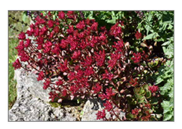
Voodoo Stonecrop in bloom