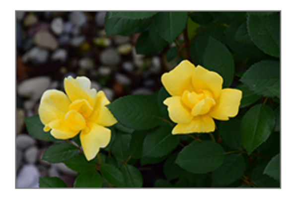
Sunny Knock Out Rose flowers