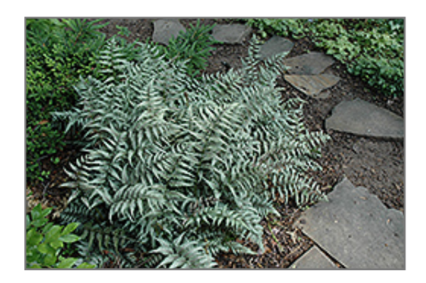
Japanese Painted Fern