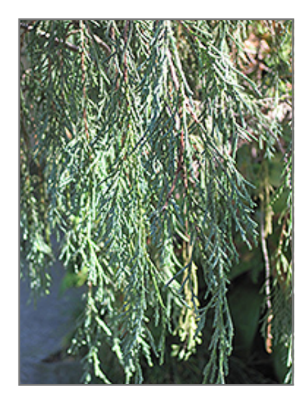
Tolleson's Weeping Juniper foliage

This shrub should only be grown in full sunlight. It is very adaptable to both dry and moist growing conditions, but will not tolerate any standing water. It is considered to be drought-tolerant, and thus makes an ideal choice for xeriscaping or the moisture-conserving landscape. It is not particular as to soil type or pH. It is somewhat tolerant of urban pollution. This is a selection of a native North American species.