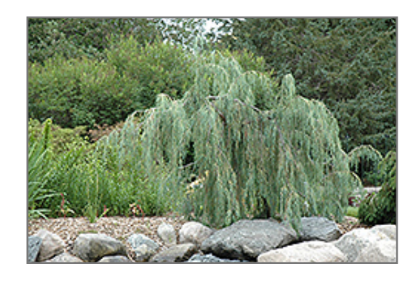
Tolleson's Weeping Juniper

This is a relatively low maintenance shrub, and is best pruned in late winter once the threat of extreme cold has passed. Deer don't particularly care for this plant and will usually leave it alone in favor of tastier treats. It has no significant negative characteristics.