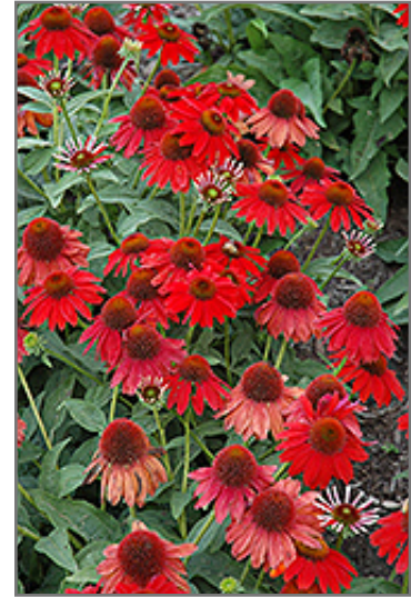
Sombrero Salsa Red Coneflower flowers

Sombrero Salsa Red Coneflower is recommended for the following landscape applications;