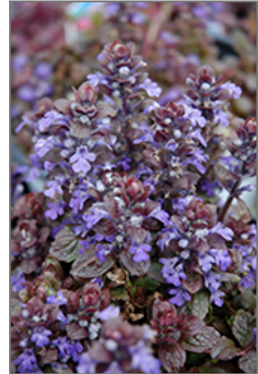
Bronze Beauty Bugleweed flowers

Bronze Beauty Bugleweed is recommended for the following landscape applications;