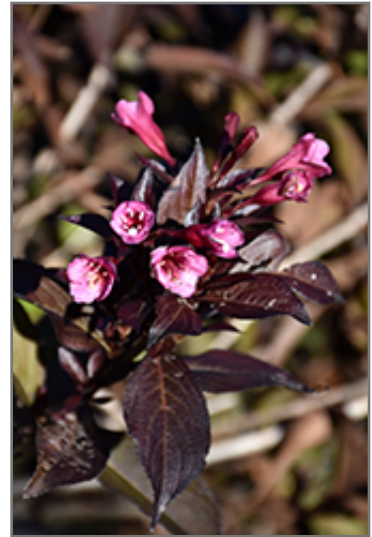
Fine Wine Weigela flowers