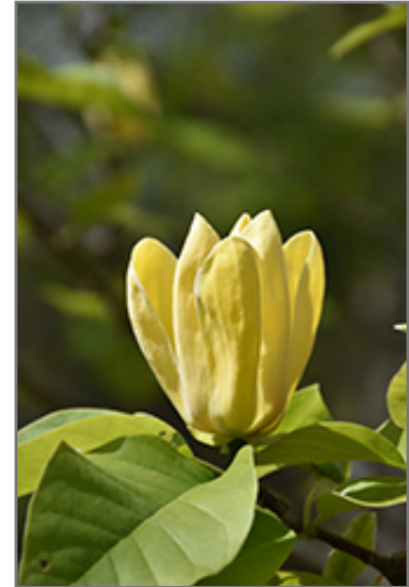
Yellow Bird Magnolia flowers